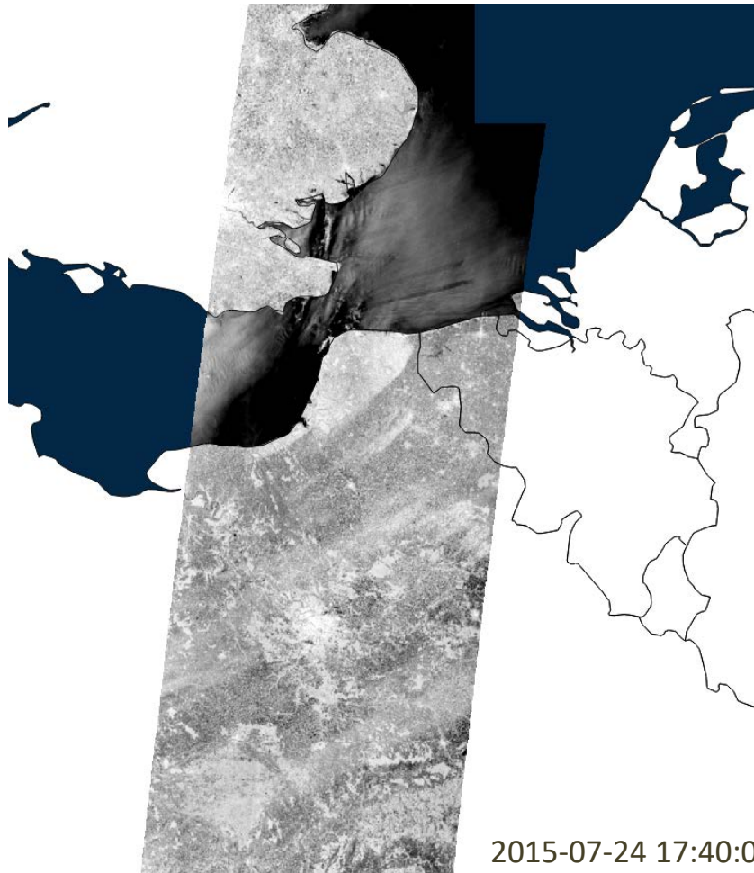
20m SAR backscatter in dB